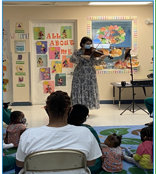
UM Frost School of Music undergraduate student performs the violin for children and families at the UM-Linda Ray Intervention Center.